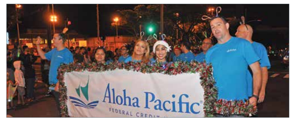
We were thrilled to march in the Honolulu City Lights Electric Light Parade and the Kaimuki Christmas Parade (pictured) last month. We hope your holidays were merry and that the new year brings much prosperity!